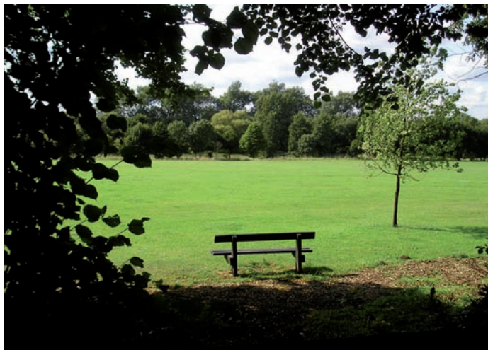
Foots Cray Meadows from Leafield Lane