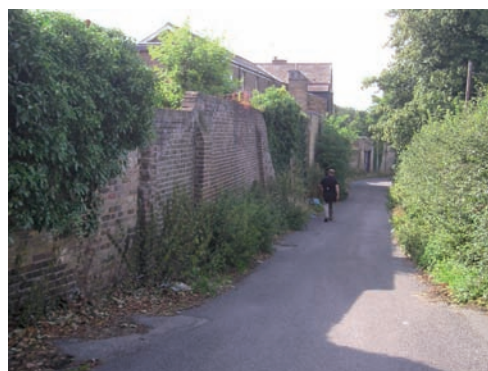
View west along Water Lane showing the rural character of the area