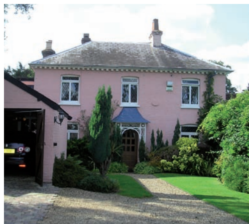
Pear Tree Cottage

7.5 Further to the south, another notable building is Pear Tree Cottage (No.166 North Cray Road, circa 1790) is a locally listed building. This cottage has walls of painted brick and a low hipped slate roof. The central doorway has a fine Victorian wrought iron porch, whilst the windows are leaded-light casements. This building contrasts with the orange-red bricks and steep tiled roof of the former Church of England school on the adjacent site (Nos. 168 -170 North Cray Road), now converted into two houses. The building dates from 1860 and saw use as the village school until 1959.