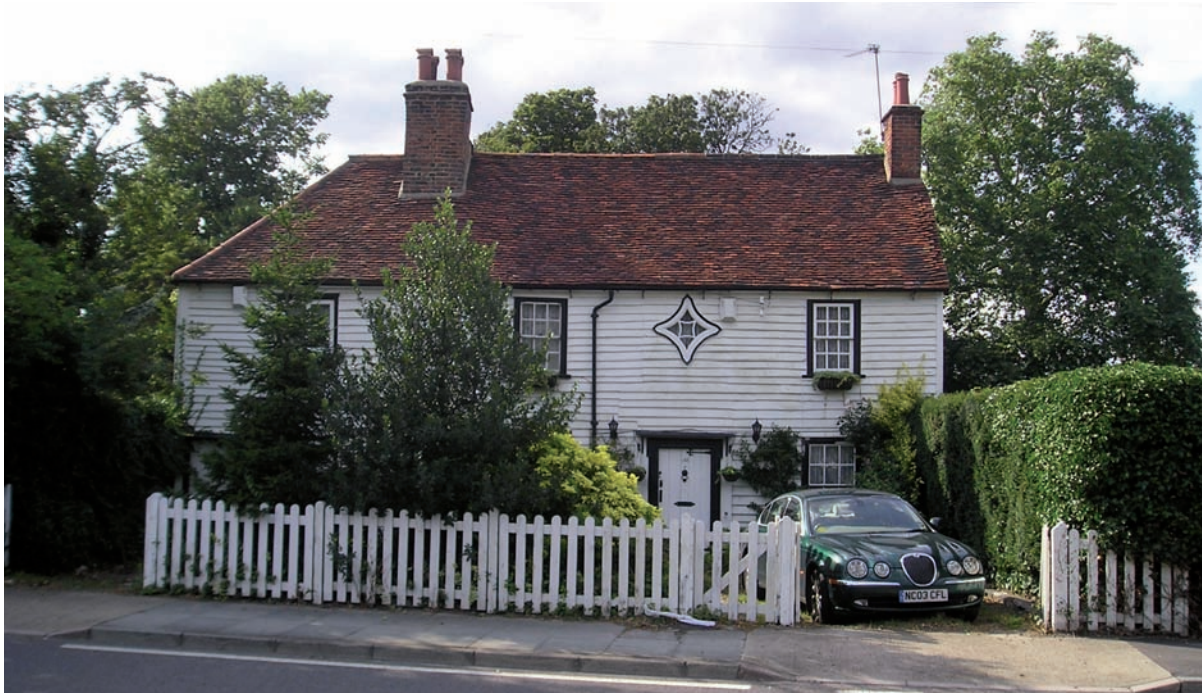
Nos. 152 and 154 North Cray Road - Grade II Listed

7.4 Adjacent to the White Cross are two timber-framed cottages (Nos.152 and 154 North Cray Road, Grade II Listed). These cottages probably date from the 16th or 17th Century. With their weather-boarded walls and tiled roofs they provide a reminder of the local vernacular that characterised the medieval Kent countryside.