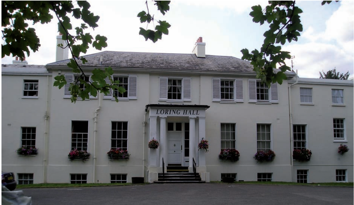
Loring Hall built circa 1760 Grade II Listed

7.8 Whilst clearly it is the group as a whole that contribute to the character of the conservation area, it is still worth making reference to one or two buildings as distinct examples of exemplar architectural style. In this respect Loring Hall and The Dower House, also a local landmark building, make a significant contribution to the area. Similarly, The White Cross Public House represents a good example of a local landmark building.