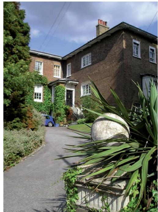
The Dower House

7.10 Green spaces within the conservation area and around the existing built environment contribute to its ambiance and rural character forming a network of biodiverse corridors that are inter-connected to the Cray River valley. These spaces, including private front and back gardens and the wooded areas within Leafield Lane and Water Lane, are important characteristics, which are intrinsic to the appearance of the conservation area.