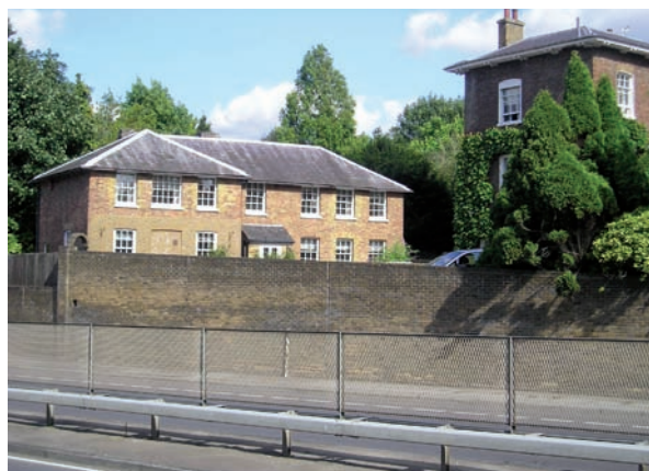
Road and wall separates Dower House from the rest of the conservation area