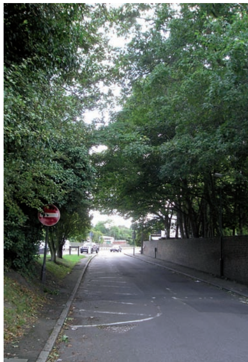
Trees in Water Lane at the entrance to Loring Hall