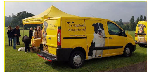
Dogs Trust Dog Chipping Event on 19 th September 2017 in Danson Park where there was also recruiting for HoundWatch and collecting signatures to save our police station.