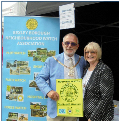
Bexley's Mayor & Mayoress also showing their support for BBNWA at QMH.

SEPT-9 th QMH OPEN DAY- (Inc. Petition signing save Bexleyheath Police Station) SEPT-19 th DOG CHIPPING EVENT-Danson Park - (Inc. Petition signing save Bexleyheath Police Station) SEPT-29 th OLDER PEOPLES FORUM-Civic Offices OCT-5 th NPSD-National Personal Safety Day-Bexleyheath Mall Shopping Centre- OCT-14 th AGEING WELL EVENT - Civic Offices OCT-17 th Petition Presentation at City Hall-to Assembly Member Gareth Bacon OCT-17 th DOGS TRUST COMMUNITY EVENT-East Wickham OCT-23 rd ZUMBA FUND RAISING EVENT-Welling OCT-25 th +26 th CORY's PUBLIC OPEN DAYS-Cory's Belvedere Plant OCT-28 th SLADE GREEN COMMUNITY DAY-Community Centre NOV-7 th NORTH CLUSTER COORDINATORS MEETING-Bexleyheath NOV-21 st SOUTH CLUSTER COORDINATORS MEETING-Bexleyheath NOV-25 th ASIAN GOLD THEFT MEETING-Danson Youth Centre DEC-1 st RESIDENTS MEETING FOR BLACKFEN & LAMORBEY & BLENDON & PENHILL WARDS WITH JAMES BROKENSHERE at Blackfen Library