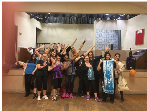
Zumba Fund Raising Event held in Welling on 23 rd October 2017