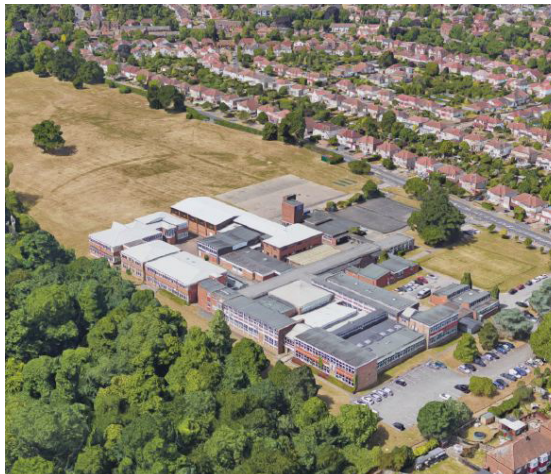
Cleeve Park School

The school will be managed by The Kemnal Academies Trust, who currently run the existing Cleeve Park School.