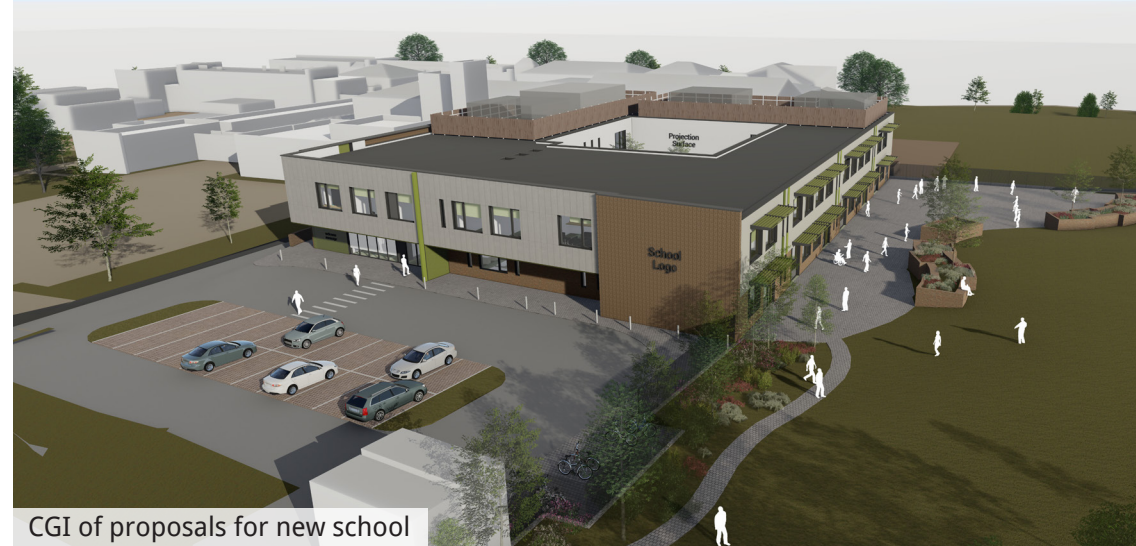
CGI of proposals for new school

VIEW THE DEVELOPMENT PROPOSALS FOR A NEW FREE SCHOOL WITHIN THE GROUNDS OF CLEEVE PARK SCHOOL